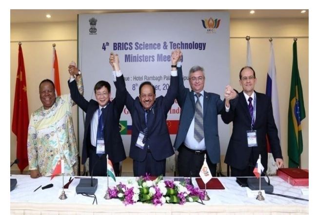
BRICS leaders at the STI Ministerial Meeting on 8 Oct, 2016

To boost the scientific relationship and forge better collaborations between the BRICS countries, the 4th S&T Ministerial meeting of the Ministers for Science & Technology of the BRICS member countries was held on 8 Oct, 2016 at Jaipur.