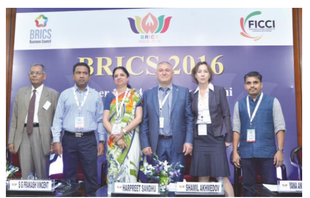
Representatives from five countries at BRICS-Biomed Round table.