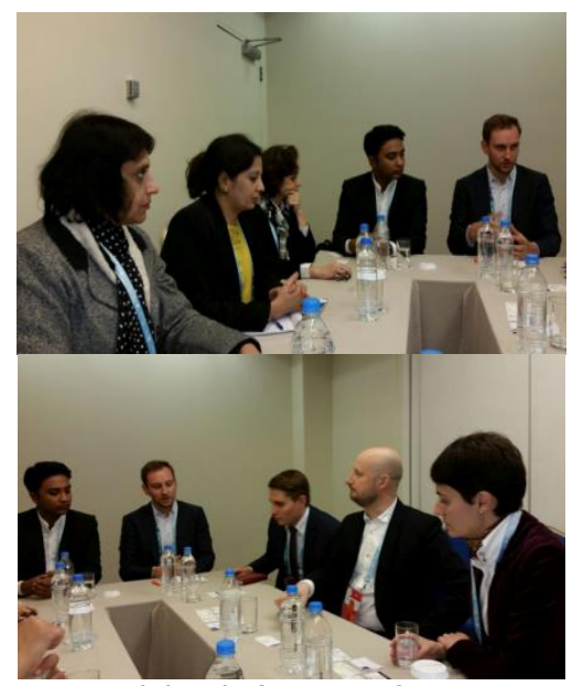
Meeting with head of Agency of Innovations in Moscow under IRBI Programme.

initiative which was conceived and formulated between the two countries to explore the possibility of supporting and accelerating cross border innovation and technologies promoted by Indian start-ups into Russian market. The three major objectives and benefits of the training program are: Acquire knowledge, understanding of the Russian market and its innovation and start up ecosystem; Get insights of Russian startups through networking events to explore collaboration: possibility mutual of Understanding of good practices of cross border trade through exposure on Russian business environment. The program is implemented by Society for Innovation and Entrepreneurship, IIT Bombay in association with Indian Embassy at Moscow and Global Venture Alliance.