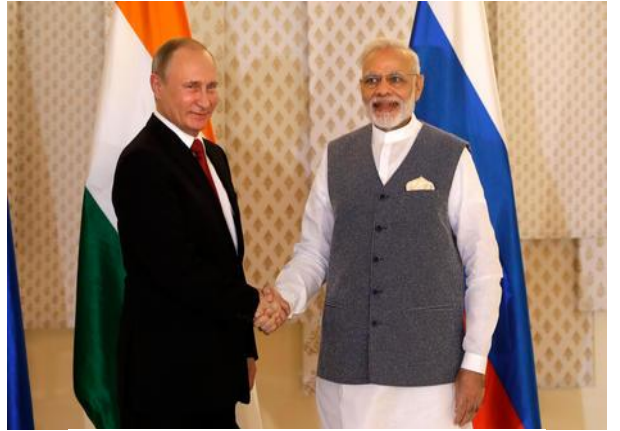
PM of India and President of Russian Federation shake hands during the 17<sup>th</sup> Indo-Russian Summit

1. 17<sup>th</sup> India-Russia Annual Summit Enhances S&T Links.