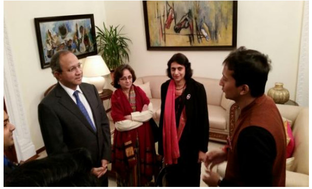
IRBI Participants at Ambassador's reception

A series of workshops and master classes were conducted to assist in understanding the local economy, market, legal and financial systems of Russia and opportunities that these present to local & foreign entrepreneurs. Some examples of workshops and master classes included a workshop «Business model that are viable in Russia» and "Presenting the startup business to potential clients" workshop.