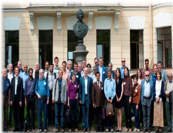
Conference Participants at Euler International Mathematical Institute

The 2 nd Indian-Russian Joint Conference in Statistics and Probability was held on May 30-03 Jun, 2016 with participation of 9 renowned experts from India and over 20 from Russia. The event was organized by St Petersburg Department of Steklov Mathematical Institute, Euler International Mathematical Institute, St. Petersburg State University and Chebyshev Laboratory, with support from Indian Statistical Institute and Chennai Mathematics Institute. Chair of the