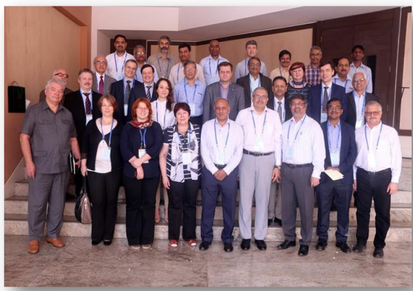
Indian and Russian RIN Participants gather in Mumbai for the first meeting in February 2016