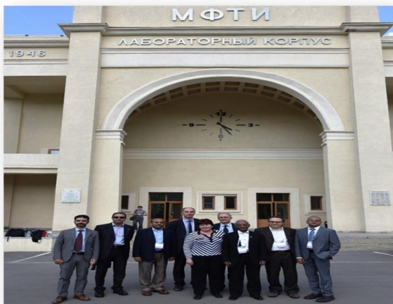
Representatives of MIPT and Amity University at MIPT Campus

The MoU will remain in effect for five years with the possibility of extending.